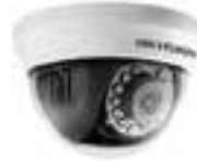
DS-2CE56C0T-IRMM Indoor IR Dome