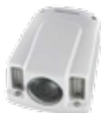
DS-2CD6510-I(O) 1.3MP Outer-vehicle Mini Dome Network Camera