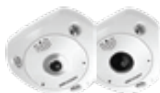
DS-2CD63C2F-I(V)(S) 12MP Panoramic IR Network Camera