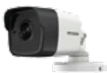
DS-2CE16D8T-IT(P) Outdoor EXIR Bullet