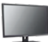
DS-D5032FC 32" LCD Monitor