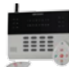
DS-19S08N-04F/Kx(Gx) 8 Zone Video Security Control Panel