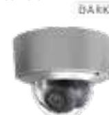
DS-2CD6626DS-IZ(H)S DarkFighter Series 2MP Anti-corrsion Dome Network Camera