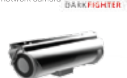
DS-2CD6652B-IZHS DarkFighter series 2MP Anti-corrsion IR Bullet network camera