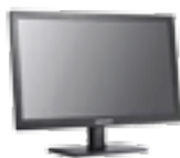
DS-D5019QE 19" LCD Monitor