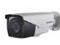
DS-2CE16D8T-(A)IT3ZE Outdoor EXIR Motorized VF Auto Focus Bullet