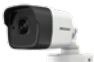
DS-2CE16F7T-IT Outdoor EXIR Bullet