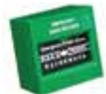
DS-K7PEB Emergency Break Glass