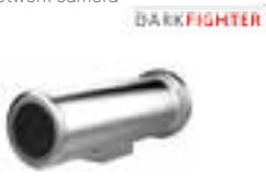
DS-2CD6626B/E-HIR5/IRA DarkFighter Series 2MP Anti-corrsion IR Bullet Network Camera