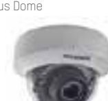
DS-2CE56D8T-(A)ITZ Indoor EXIR Motorized VF Auto Focus Dome