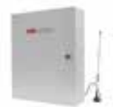
DS-19A00-BN 8/16 Zone Video Control Panel