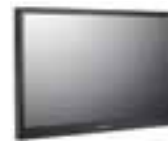
DS-D5055FL 55" LCD Monitor