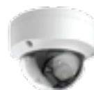
DS-2CE56F7T-VPIT Outdoor Vandalproof EXIR Dome