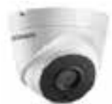
DS-2CE56D8T-IT1/3E Outdoor EXIR Eyeball