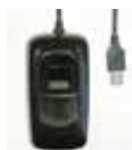
DS-K1F810-F Fingerprint Card Issuer