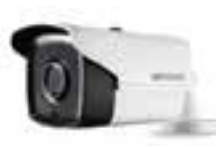
DS-2CE16D8T-IT1/3/5 Outdoor EXIR Bullet