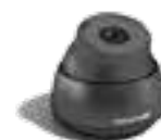
DS-2XM6612FWD-I (1.3MP) DS-2XM6622FWD-I (2.0MP) Mobile Network Camera