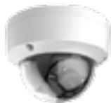
DS-2CE56D8T-VPITE Outdoor Vandalproof EXIR Dome