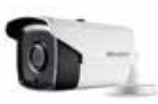
DS-2CE16D8T-IT1/3/5E Outdoor EXIR Bullet