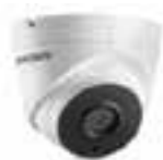
DS-2CE56D8T-IT1/3 Outdoor EXIR Eyeball