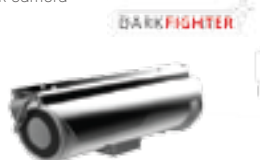
DS-2CD6626BS-R DarkFighter Series 2MP Anti-corrsion Bullet Network Camera