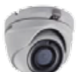
DS-2CE56D8T-ITM Outdoor EXIR Eyeball