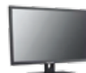
DS-D5043FC 43" LCD Monitor