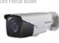
DS-2CE16D8T-(A)IT3Z Outdoor EXIR Motorized VF Auto Focus Bullet