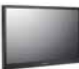
DS-D5084UL 84" LCD Monitor