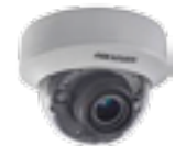
DS-2CE56D7T-(A)ITZ Indoor EXIR Motorized Vari-focal Dome