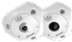
DS-2CD6332F-I(V)(S) 3MP Panoramic IR Network Camera