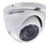
DS-2CE56C0T-IR(M) Outdoor IR Eyeball