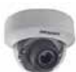
DS-2CE56D8T-(A)ITZE Indoor EXIR Motorized VF Auto Focus Dome