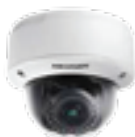
DS-2CD41C5F-IZ 12MP Indoor IR Dome Network Camera