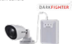
DS-2CD6426FWD-50 DarkFighter Series 2MP Mini Bullet Covert Network Camera