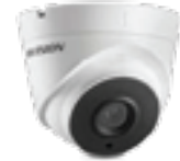
DS-2CE56C0T-IT1/3 Outdoor EXIR Eyeball