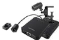
DS-2CD6424FWD-10/20/30 2MP Covert Network Camera