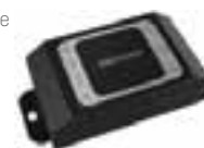
DS-K2M060 Secure Module