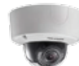
DS-2CD45C5F-IZ(H) 12MP IR Dome Network Camera