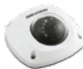
DS-2XM6122FWD-I(M) 2MP Vehicle Mini Dome network camera