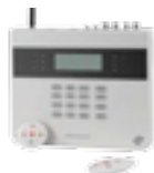
DS-19S08-04F/Kx(Gx) 8 Zone Video Security Control Panel