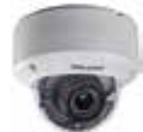
DS-2CE56D8T-(A)VPIT3ZE Outdoor EXIR Motorized VF Auto Focus Dome