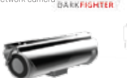
DS-2CD6626B-IZHS DarkFighter series 2MP Anti-corrsion IR Bullet network camera