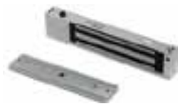
DS-K4H250S Magnetic Lock