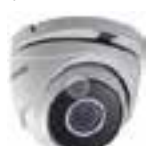
DS-2CE56D8T-IT3ZE Outdoor EXIR Motorized VF Auto Focus Eyeball