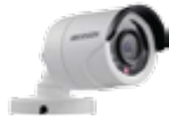
DS-2CE16C0T-IR(P) Outdoor IR Bullet