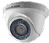
DS-2CE56C0T-IRP Indoor IR Eyeball