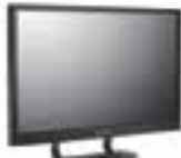
DS-D5032FL 32" LCD Monitor